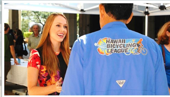
Talking with the Hawaii Bicycling League about the Waialua Bike Path and safe routes to school.