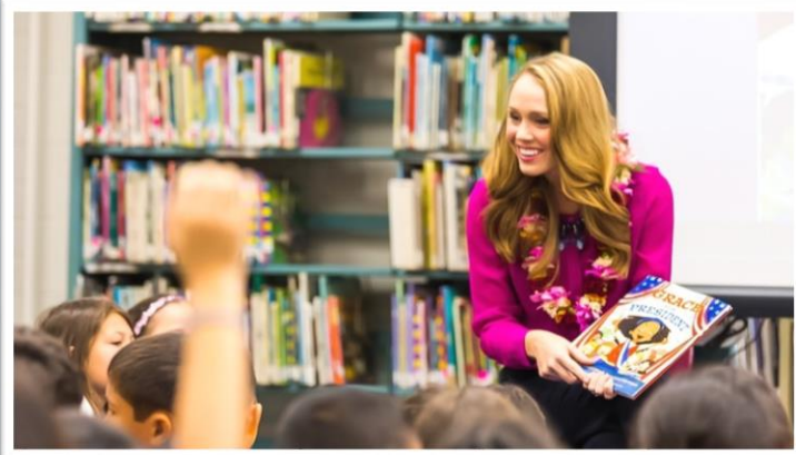
Reading the book "Grace for President" to the students of Mililani Waena Elementary.