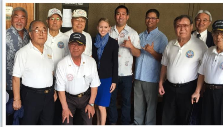
Had a wonderful conversation with Korean War Veterans at a Veterans and Military Affairs Committee hearing.