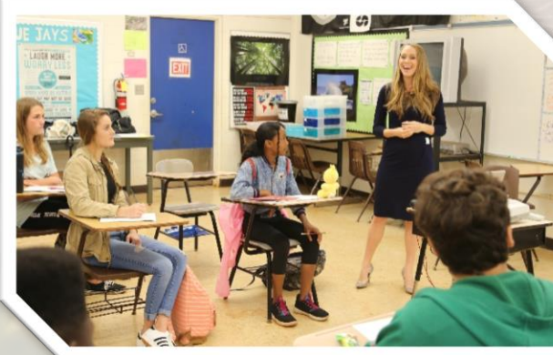
I was invited to speak at Wheeler Middle School Career Day about running for office and jobs at the legislature.