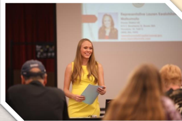
My office held Town Hall Meetings in both Mililani and Waialua to discuss legislative updates.