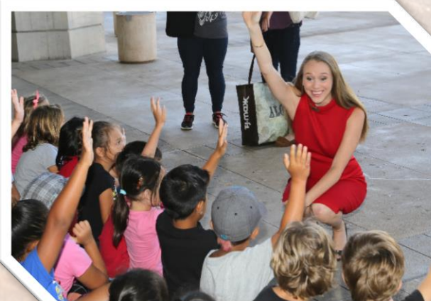
Waialua Elementary 1 st Graders had great questions during their visit at the Capitol.