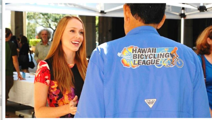
Talking with the Hawaii Cycling League about the Waialua Bike Path and safe routes to school.