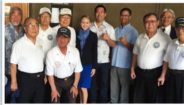
Had a wonderful conversation with Korean War Veterans at a Veterans and Military Affairs Committee hearing.