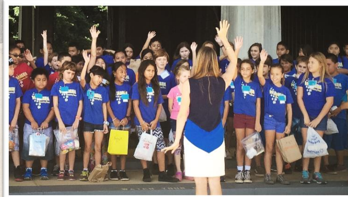
Teaching the students of Waialua Elementary School about the legislative process at the State Capitol.