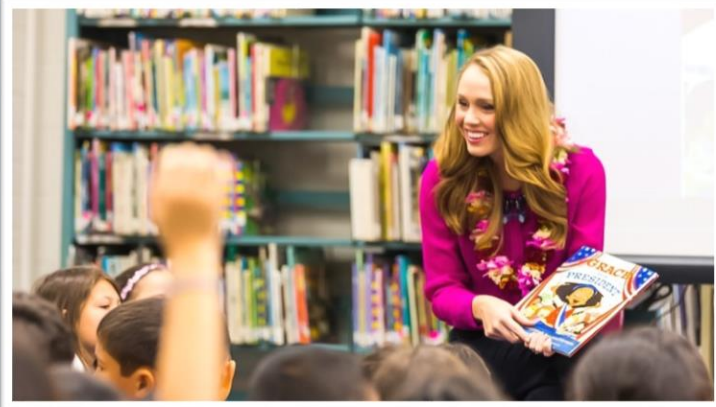
Reading the book "Grace for President" to the students of Mililani Waena Elementary.