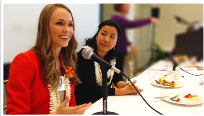
Sharing my priorities as co-convenor of the Hawaii Women's Legislative Caucus at our 2016 Legislative Update Breakfast.