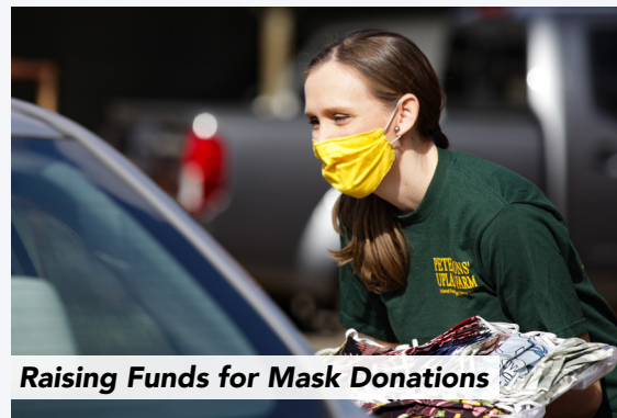
Raising Funds for Mask Donations