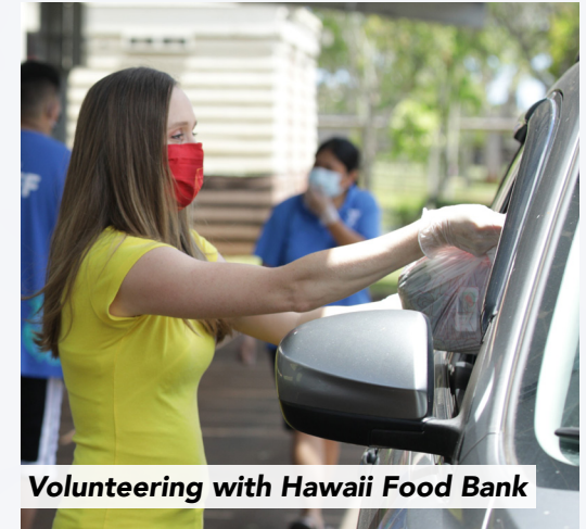
Volunteering with Hawaii Food Bank