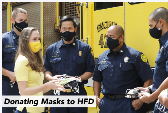
Donating Masks to HFD

I am so inspired by the way our community has come together to help each other get through this difficult time, flatten the curve, and slow the spread of COVID-19. It truly demonstrates Hawaii at its best. On behalf of all the essential workers in our community - mahalo! If you want instructions on how to sew your own mask I filmed a tutorial and it is available at RepMatsumoto.com.