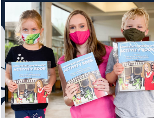
ELEMENTARY SCHOOL VISITS: This session I was delighted to visit schools both in person and virtually via zoom to share about my job as a State House Representative, and learn more about the three branches of Government.