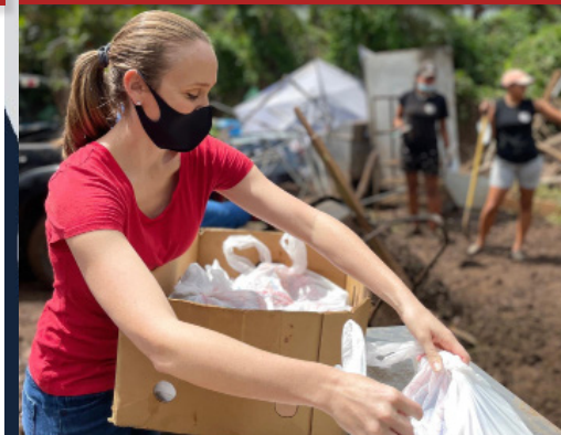
NORTH SHORE FLOOD CLEAN UP: My staff and I helped to pass out food to residents and volunteers, helped with clean up and listened to the needs and concerns of those in the community.