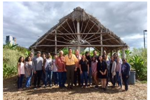
Legislators and staff with students from UH West Oahu