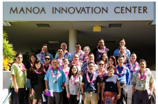
2017 Legislative Innovation Crawl

This past month, Mililani Middle School's robotics teams competed at the Stevenson VEX IQ Challenge and earned the top ranks of 1 st and 2 nd place! The VEX Blazerbots Team A wowed judges and won the most prestigious award at the event, the Excellence Award – both Mililani Middle School teams will be moving on to the State Championship in January! Congratulations to Mililani Middle School and go Blazerbots!