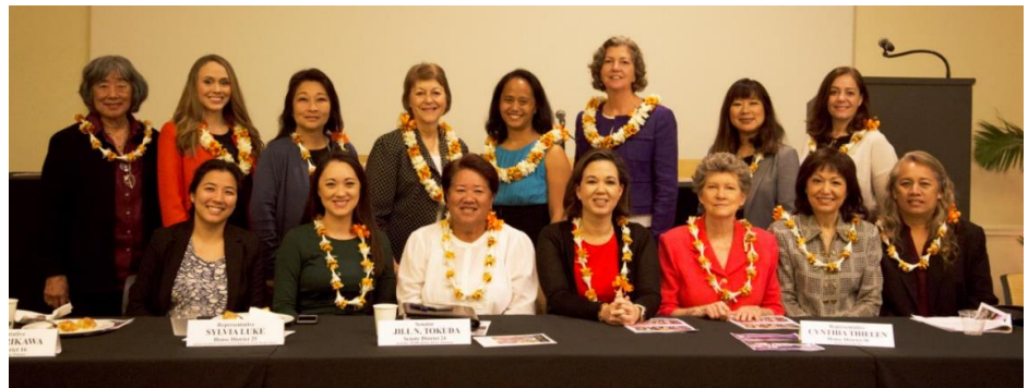
Members of the 2018 Women's Legislative Caucus

Encompassing women legislators' viewpoints from both the Senate and the House of Representatives, the Women's Legislative Caucus (WLC) of the State of Hawai'i continues to advocate for bills on behalf of the women of the state of Hawai'i. The caucus has focused on such as human trafficking, health, domestic abuse, and education.