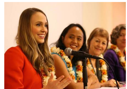
Women's Legislative Caucus Press Conference - YWCA