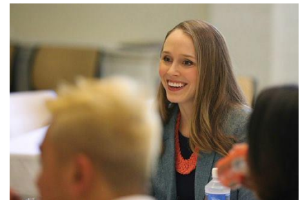
Discussing the legislative process with Mililani students