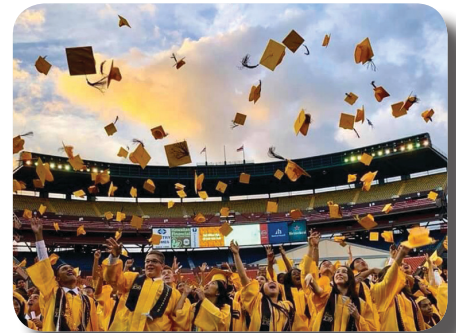
Congratulations to Mililani High School's Class of 2019!

As the Legislative Session and the school-year ends, I want to congratulate all of our 2019 graduates for their hard work and accomplishments. I wish you all the best of luck in your future endeavors. Continue to cherish the moments, experiences, and people who helped you reach this point in your lives, and may you have the courage to pursue your passions.