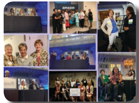
Highlights from the Women in Government Conference

other issues including healthcare, education, and transportation.