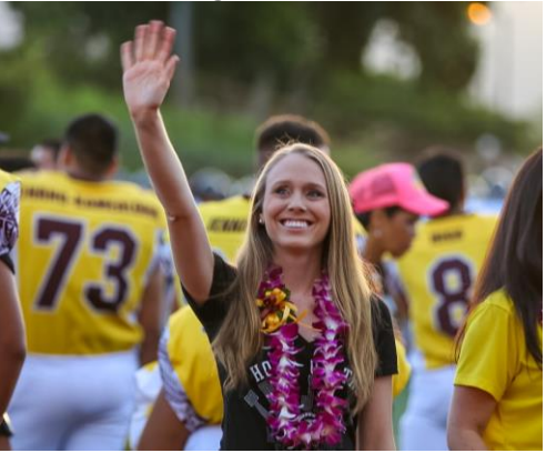
At the 2016 Homecoming Game