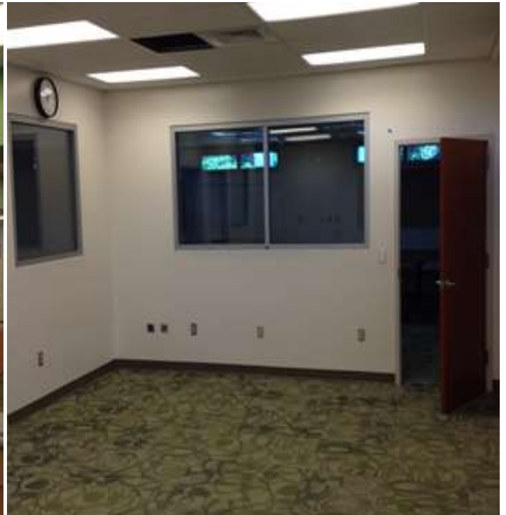
A work space in the Library.