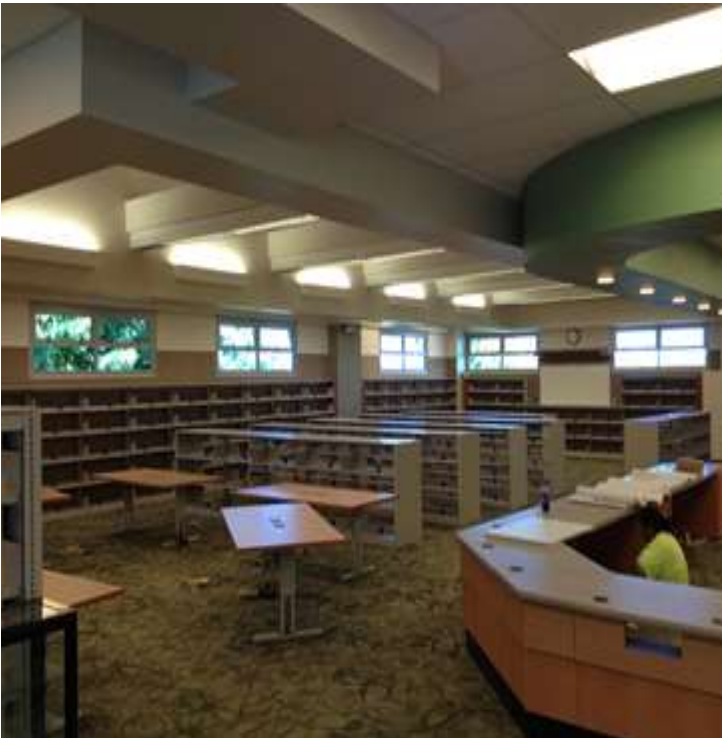
The Main Library Room.