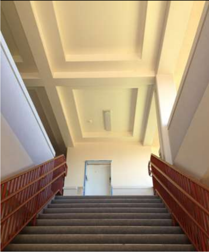
Another entry point to the Waialua Elementary School Library.