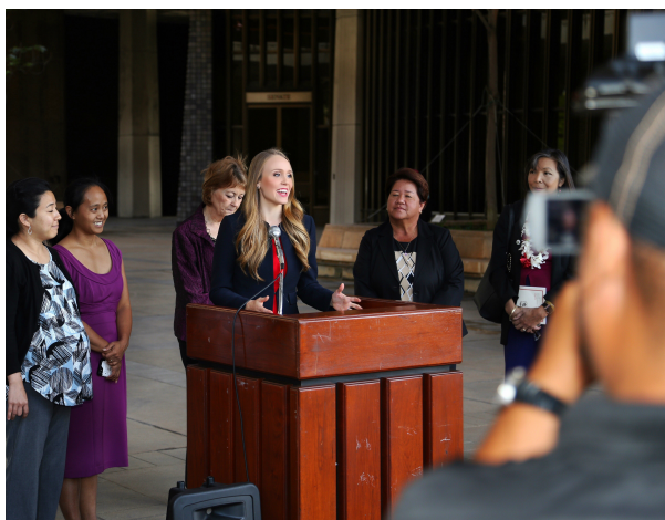
Speaking at the press release discussing opioid abuse and actions we plan to take to prevent it.