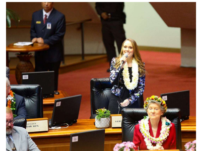
Back in Session!