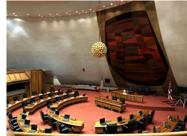
Opening Day is January 17, 2018