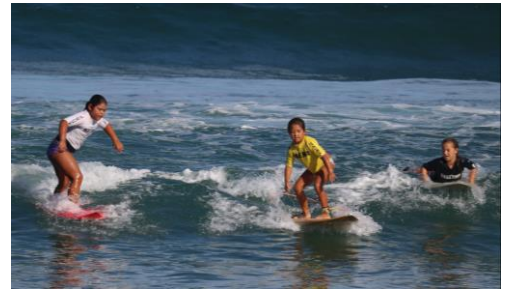
North Shore Menehune Surf Contest