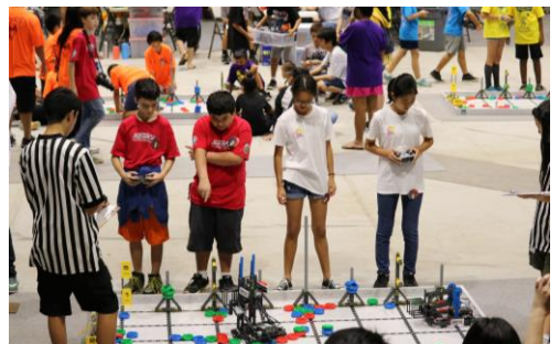
Waialua's team (left) concentrating to clear objectives