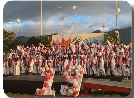
Congratulations to Waialua High School's Class of 2019!

The Class of 2019 had nine valedictorians this year. Way to go Bulldogs! Congratulations again on your achievements!