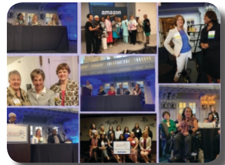
Highlights from the Women in Government Conference

other issues including healthcare, education, and transportation.